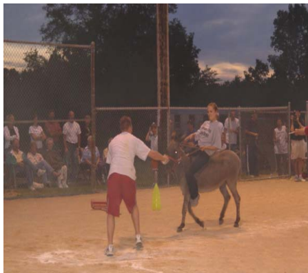
She's SAFE! HOMERUN!

Clean-up after our show is just like clean-up after a regular event!